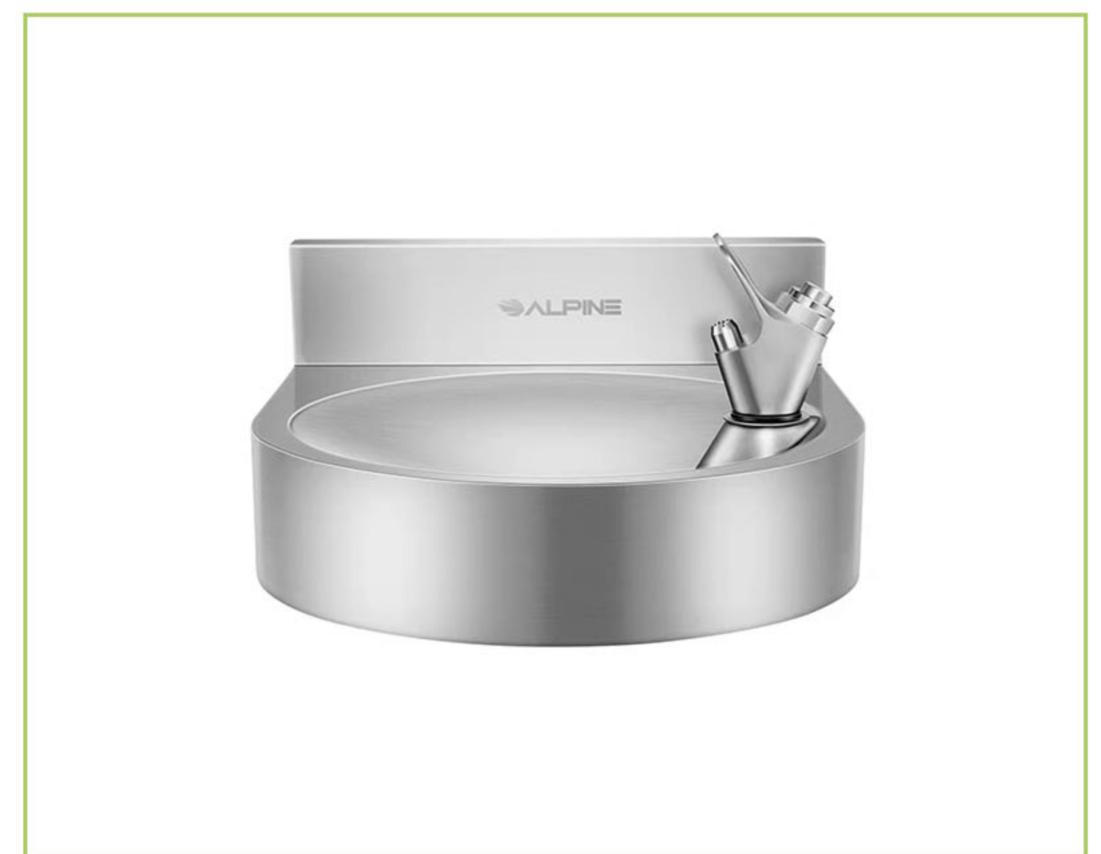
Rounded edges help prevent injury.

Assembly: Its user-friendly build makes it simple to you to have it up and running in no time.