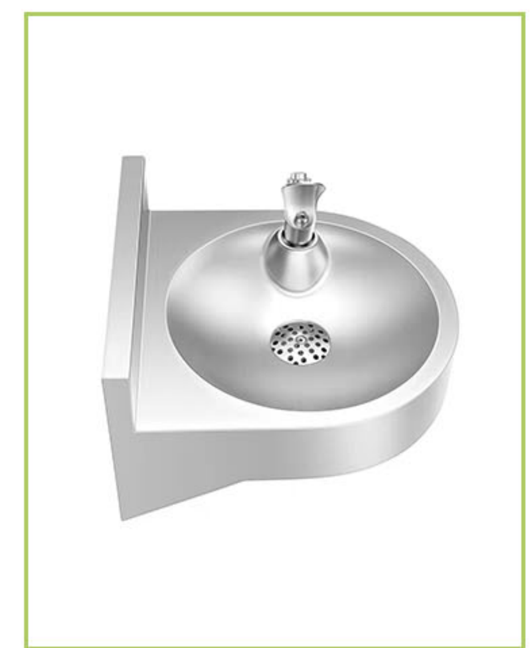
Can be utilized indoors or outdoors.